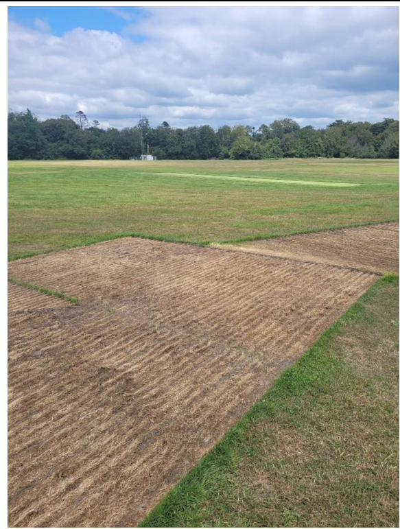
Figure 3 Damage to Sandyford CC cricket field due to Longitude [2]