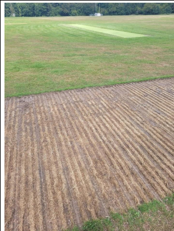
Figure 2 Damage to Sandyford CC cricket field due to Longitude [1]