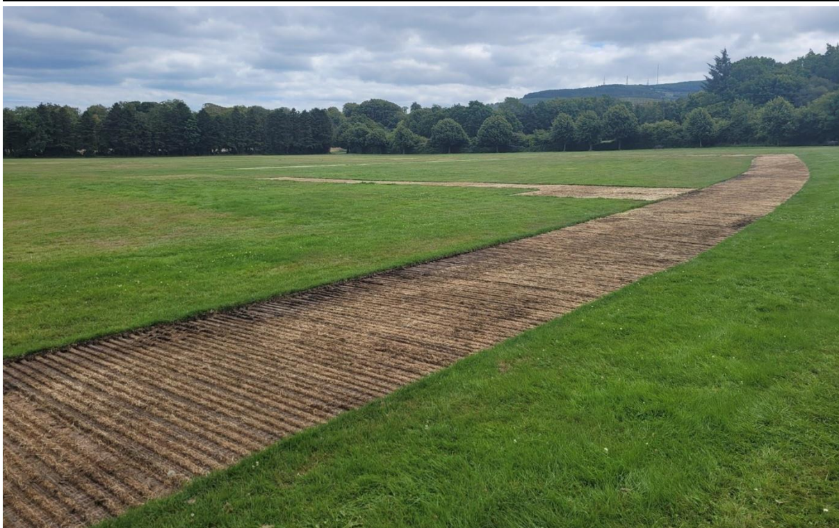
Figure 4 Damage to Sandyford CC cricket field due to Longitude [3]