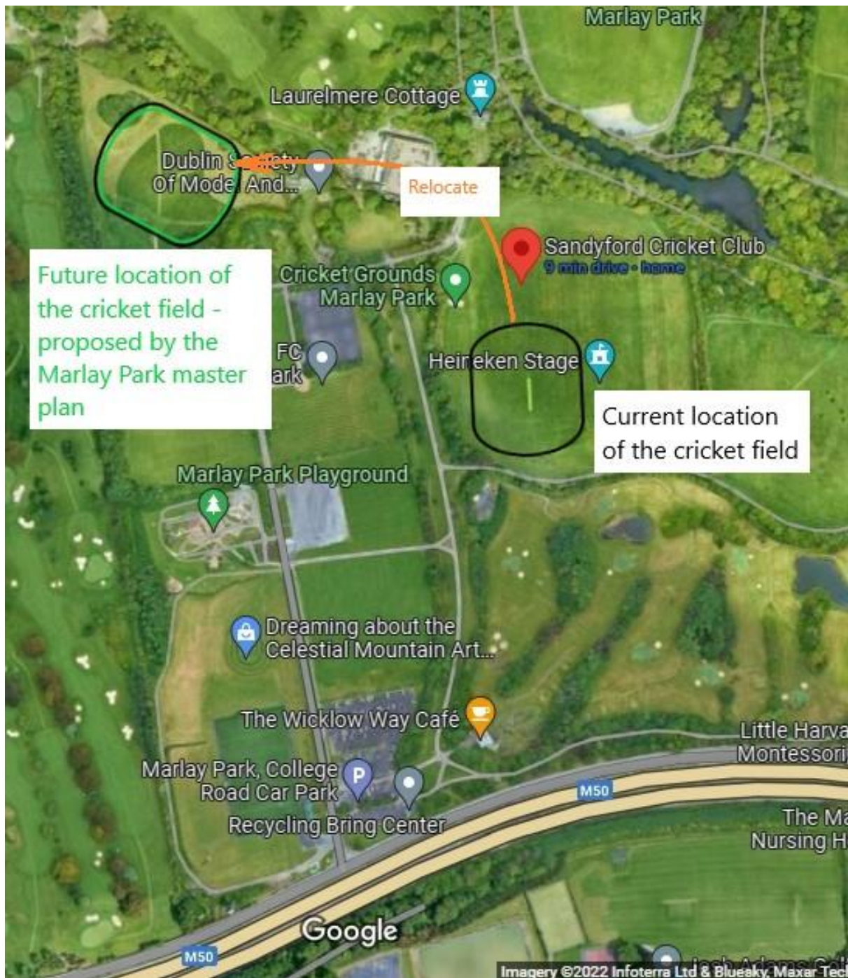
Figure 5 Cricket field relocation based on Marlay Park master plan

Our opinion is that rather than spending money each year in the current location, it is best to move the cricket ground to the Northwest field right away so that the cricket club can start in the new location from next season.